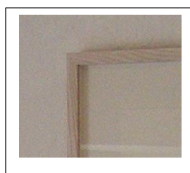
Limewashed wood moulding. Box frame.

Frame and moulding kept as neutral as possible.