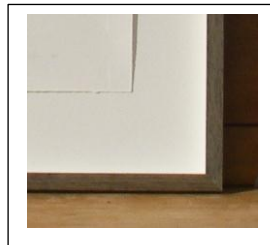
Charcoal colour moulding. Stained wood. Box frame.

The colour of the moulding picks up and matches the colour of the graphite in the work.